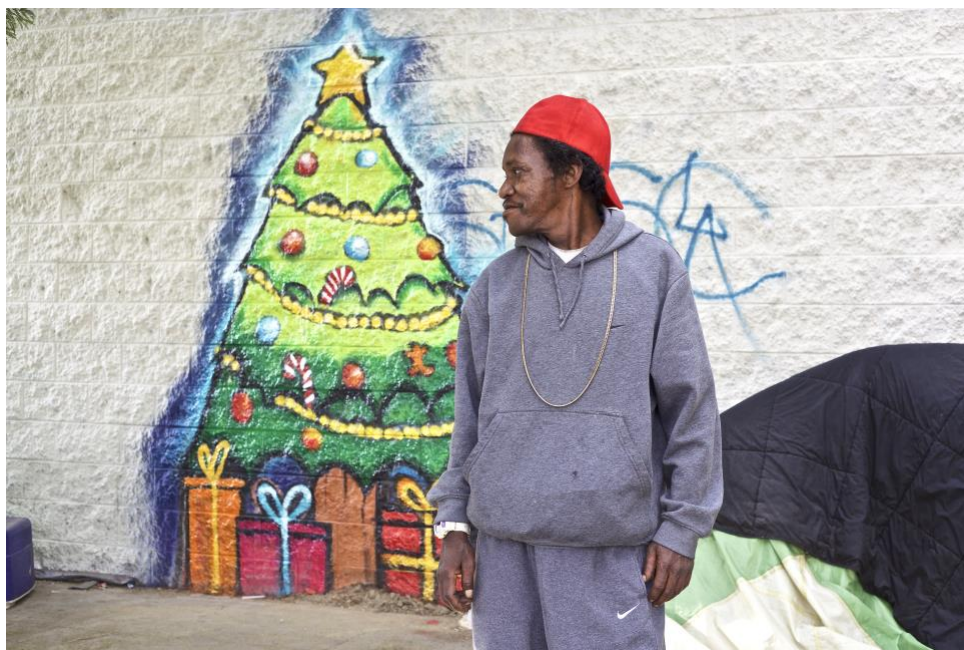
Figure 3. A Christmas's Tree and Gifts for a Homeless Individual. Photography provided by Skid Robot. Used with permission. Courtesy of the artist.