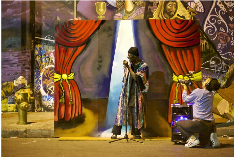
Figure 1. A Stage for Homeless Individuals to Perform. Photography provided by Skid Robot. Used with permission. Courtesy of the artist.

Figure 2 features a street camping site where homeless people live. Robot painted a serene mountain scenery on the wall as a backdrop to situate homeless people's living conditions. The nightly mountain scenery is illustrated with a deep blue sky, a white crescent moon, and a blue lake filled with seemingly calming spring water. The serenity of this natural landscape offers homeless people a sense of comfort and peace, which securely housed persons take for granted (see Figure 2). Figure 3 shows a homeless person who is getting into the Christmas spirit. He is surrounding himself with a delightfully decorated Christmas tree and several colorful presents. Through the mural, Robot enables homeless people to participate, at least in some way, in the cheerful spirit of the holiday season.