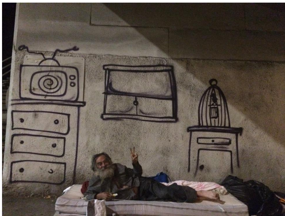
Figure 5. A Bedroom Mural for a Homeless Individual. Photography provided by Skid Robot. Used with permission. Courtesy of the artist.

Similarly, using a spray paint and sketch technique with some line work, Robot creates a bedroom feel for a homeless person (see Figure 5). The bedroom is simple yet cozy. In this mural sketch, the homeless person imaginarily has a clothes drawer with a TV on top and a birdcage housing his pet to keep him company. His bedroom has a window right above him as he is lying on his mat, smiling and greeting the viewer. Robot's simple sketch brings tremendous warmth and imaginary comfort for the person seeking to find a sense of comfort as if they had a home.