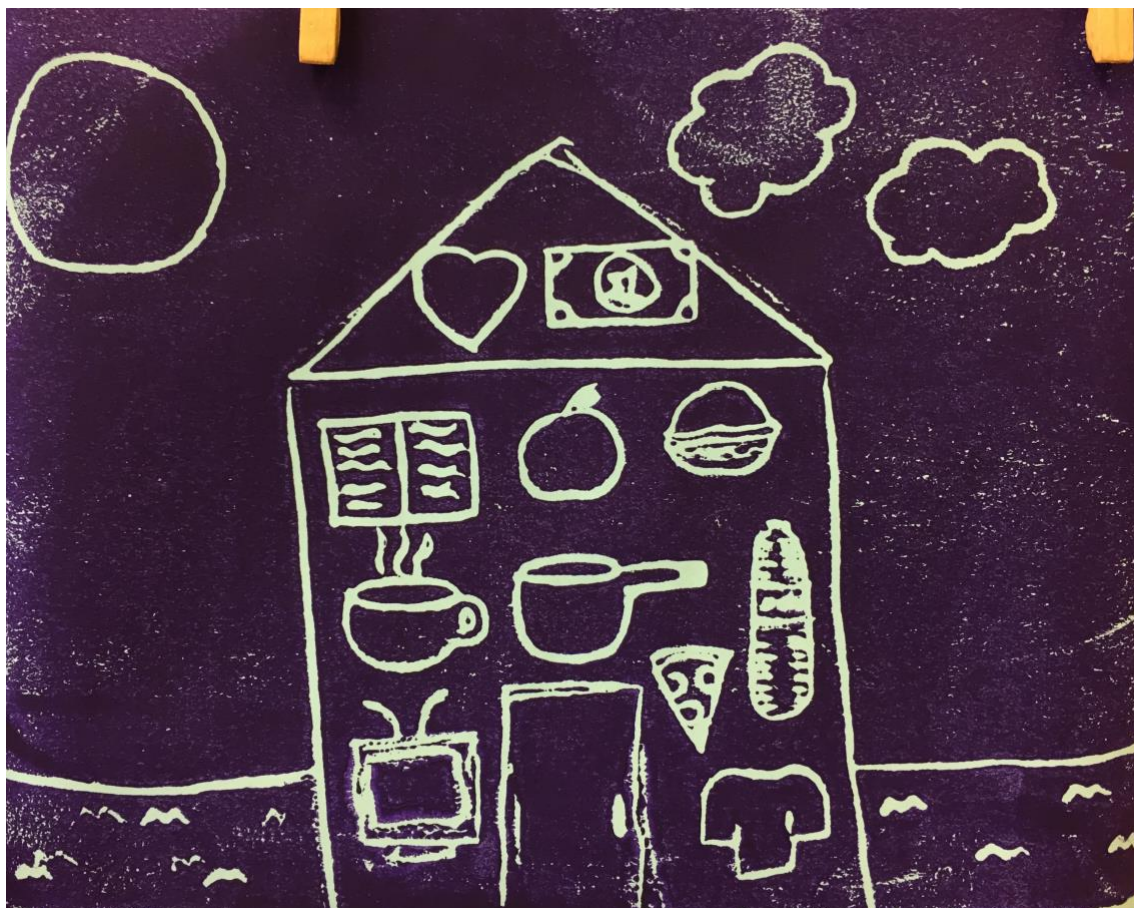
Figure 6. A Home for the Homeless People Drawn by an Elementary School Student.

society and an image of money, representing donated funds to organizations helping homeless people.