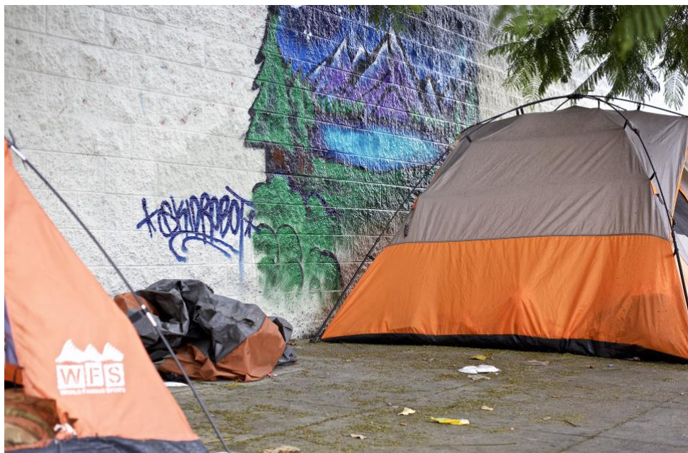
Figure 2. A Mountain Scenery for Homeless People's Camp Site. Photography provided by Skid Robot. Used with permission. Courtesy of the artist.