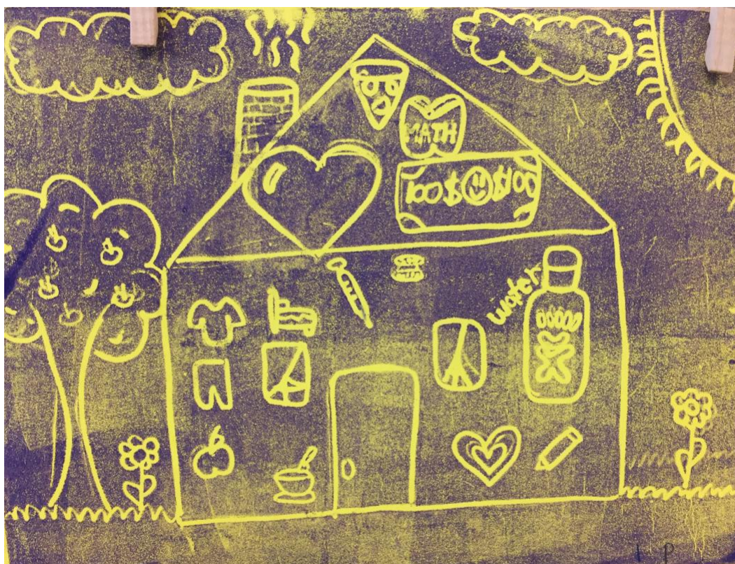
Figure 8. A Home for the Homeless People Drawn by an Elementary Student.

At the end of the lesson, students wrote a short statement about how they could help homeless people. Their responses included: “People can make care packages. Open food banks” (Julia’s response, 2019). “Donate and open more food banks” (Tim’s response, 2019). “Lend them a place to stay. Give food/water. Donate. Build homeless shelters. Food drives/banks” (Jack’s response, 2019) “Donate money, so others can help them. Volunteer, so you can help them. Donate clothes, so they can have clean clothes” (George’s response, 2019). “Give them food. We can build homeless shelters.” “Make mini homes for homeless people” (Loe’s response, 2019).