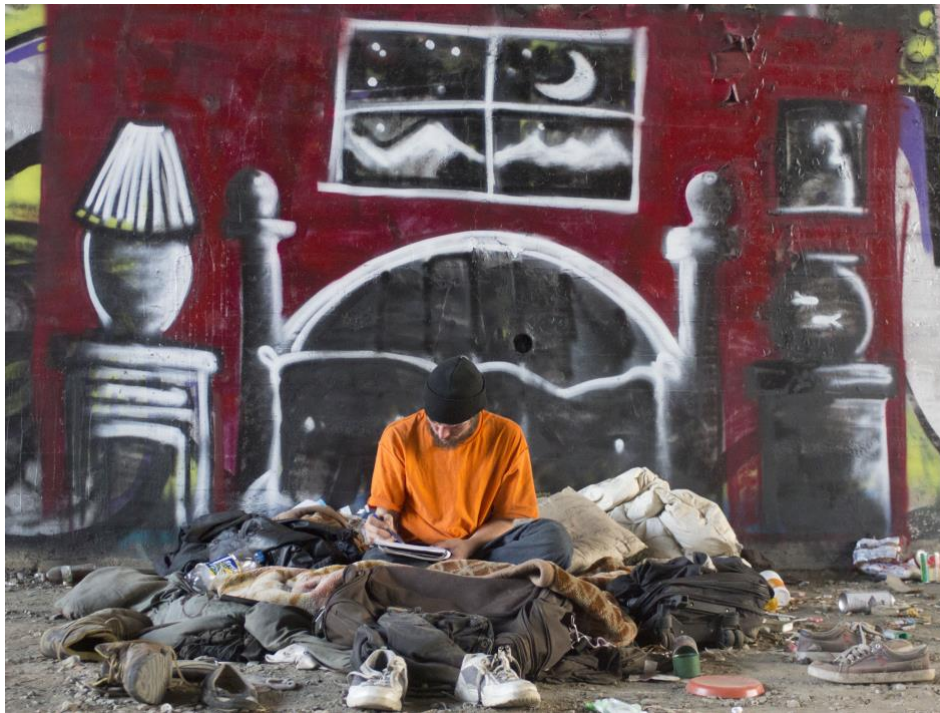
Figure 4. A King-size Bed for Homeless People. Photography provided by Skid Robot. Used with permission. Courtesy of the artist.

Robot's art serves as a powerful tool to fulfill dreams and wishes of homeless people living on the streets. Figures 4 and 5 are two examples of what homeless people would need in real life. In Figure 4, a king-size bed, a bedside lamp, and a fishbowl are placed purposefully next to the bed to accentuate a home-like touch. There is a window behind the bed where viewers can clearly see stars and the moon. A painting is hung above the fishbowl in this imaginary bedroom. The warm red color also shapes the cozy atmosphere of a home. As seen, a homeless individual appears to write on his notebook, surrounded by a pile of clothes and bedroom accessories. The bedroom mural again offers the individual a sense of feeling at home.